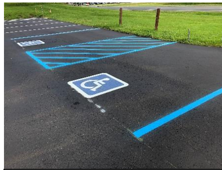
Good Quality - WB Paint + Hot Tape Accessible Symbol