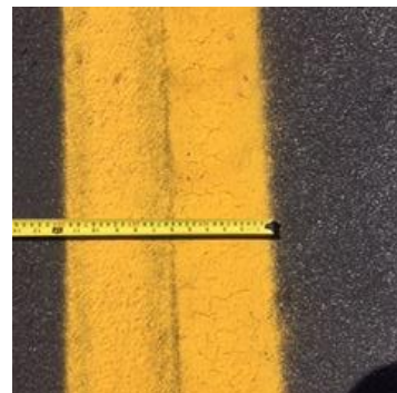
12" Yellow instead of 6"Y