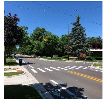
Good Quality - LL WRFL Poly + Overlay CP Special Mkgs.